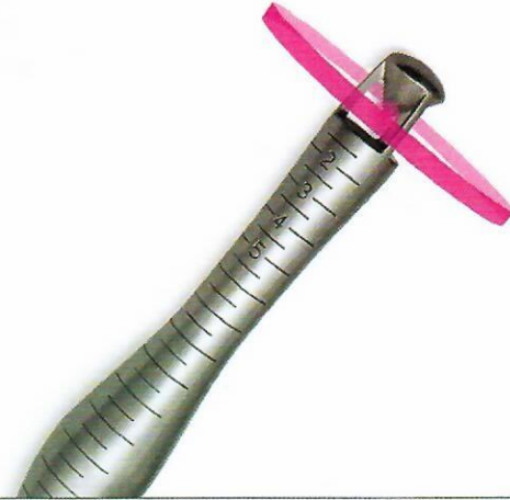
Ladylift Vaginal Handpiece.